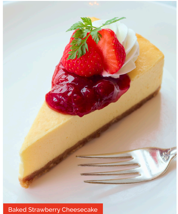
Baked Strawberry Cheesecake