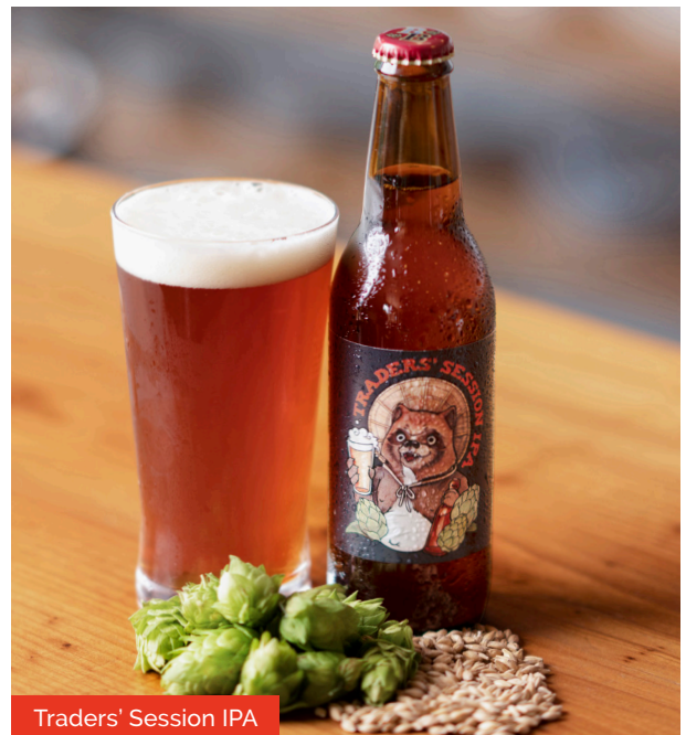
Traders' Session IPA

BIÈRE DES AMIS 0.0 (BOTTLE) · 1,000 alcohol-free